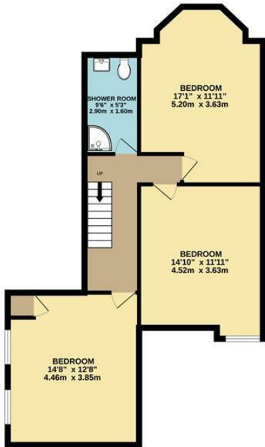
LOWER GROUND FLOOR 660 sq.ft. (61.3 sq.m.) approx.